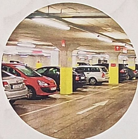
Ample Car Parking Space