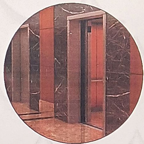
High Speed Modern Elevator