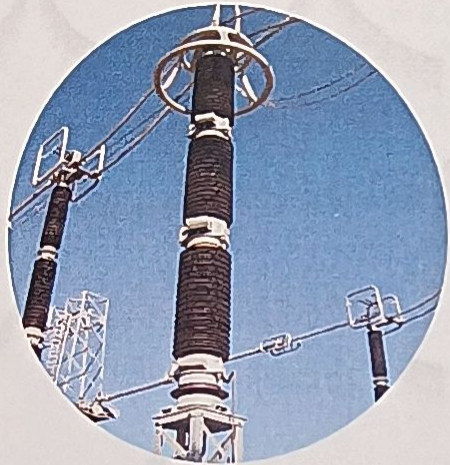
Lightning Arrester System